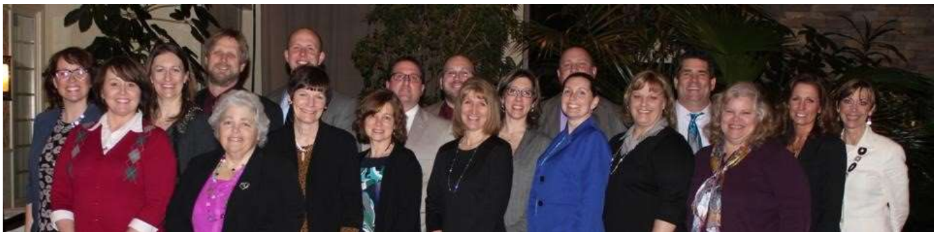
Staff that attended from ELCO